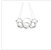
CH94824-AS Antique Silver