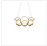
CH94824-AN Antique Brass

Die-cast aluminum rings with translucent acrylic diffusers. Metallic brushed or matte powder-coat finish. Outward emitting light. Custom options available.